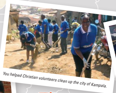
You helped Christian volunteers clean up the city of Kampala.