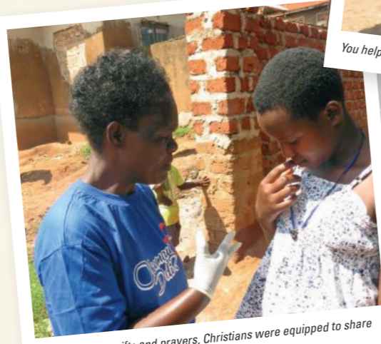
Thanks to your gifts and prayers, Christians were equipped to share the Good News of Jesus Christ with Ugandans.

Because of you, the Great Commission is being fulfilled across Rwanda and beyond – and lives are being changed forever. Thank you for your partnership in the Gospel to open new opportunities!