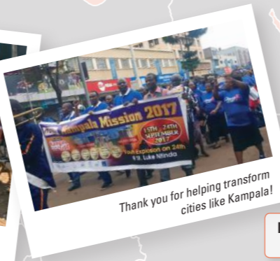
Thank you for helping transform cities like Kampala!